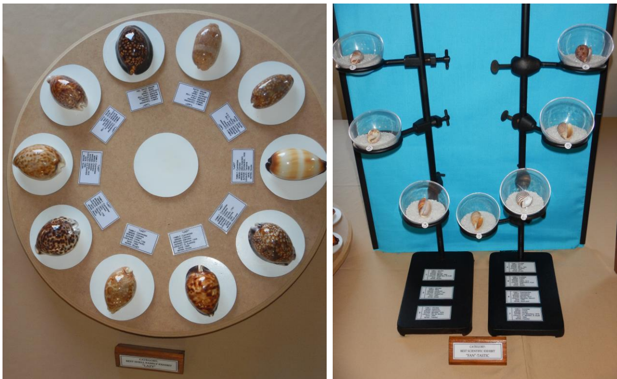
Two of the Exhibits, showing real quality and workmanship

We also tested a new Exhibit Adjudication Form, which we will be adapting and improving for the next AGM. We will also be revealing the theme and categories for the 2018 AGM Exhibits soon, so as to give everyone wishing to create an Exhibit more than enough time to prepare and make their masterpieces.