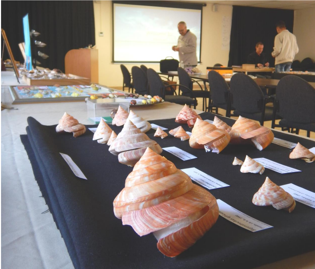
The Exhibit table

Another big word of thanks from me to all who put in many hours of planning, building and creating, and who took the time and effort to display an Exhibit at the 2017 AGM. Also a round of congratulations to all who won an award; I promise I will abstain from entering next year... 😊